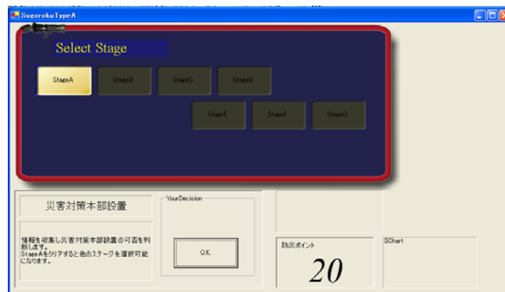
Figure 2 Disaster prevention ‘Sugoroku’ on PC: The opening

The structure of the game is exactly the same in both versions. However, the computerized version requires a deeper level of information processing and decision making by the player, because the screen limits the view of the player as compared with the board game.