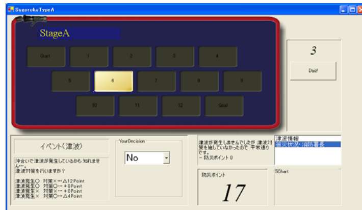
Figure 3 Disaster prevention 'Sugoroku' on PC: Decision making process (Stage A)

The third version of the 'Search & Rescue' game, is a different game that is based on different material. From the outset, the game was designed for stand-alone use on a computer. As seen in Figure 4, the screen shows a map of a city (in this case Yokohama, Japan). The aim of the game is for the player to act as the commander of the fire department at the emergency operations center, and to extinguish fires after an earthquake efficiently and effectively, while rescuing people. This game can test the impact of a player's allocation of available resources and logistics planning; to successfully allocate resources and formulate a plan, players must scrutinize resource and logistics information carefully, as this information is not easily accessible or intelligible.