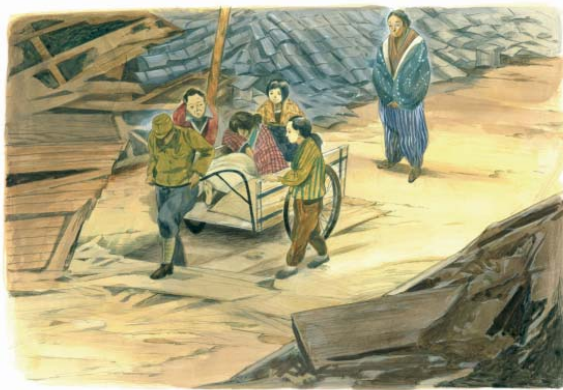
(3) My parents who had survived the earthquake came to pick them up in a cart.