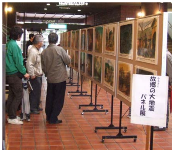
Figure4 A dialogue with the victims using the pictorial materials. (Anjo-shi in Aichi prefecture on November 2005.)