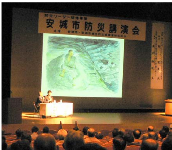
Figure3 An example of pictorial description which described a personal disaster experience. These pictures were painted by T. Fujita.