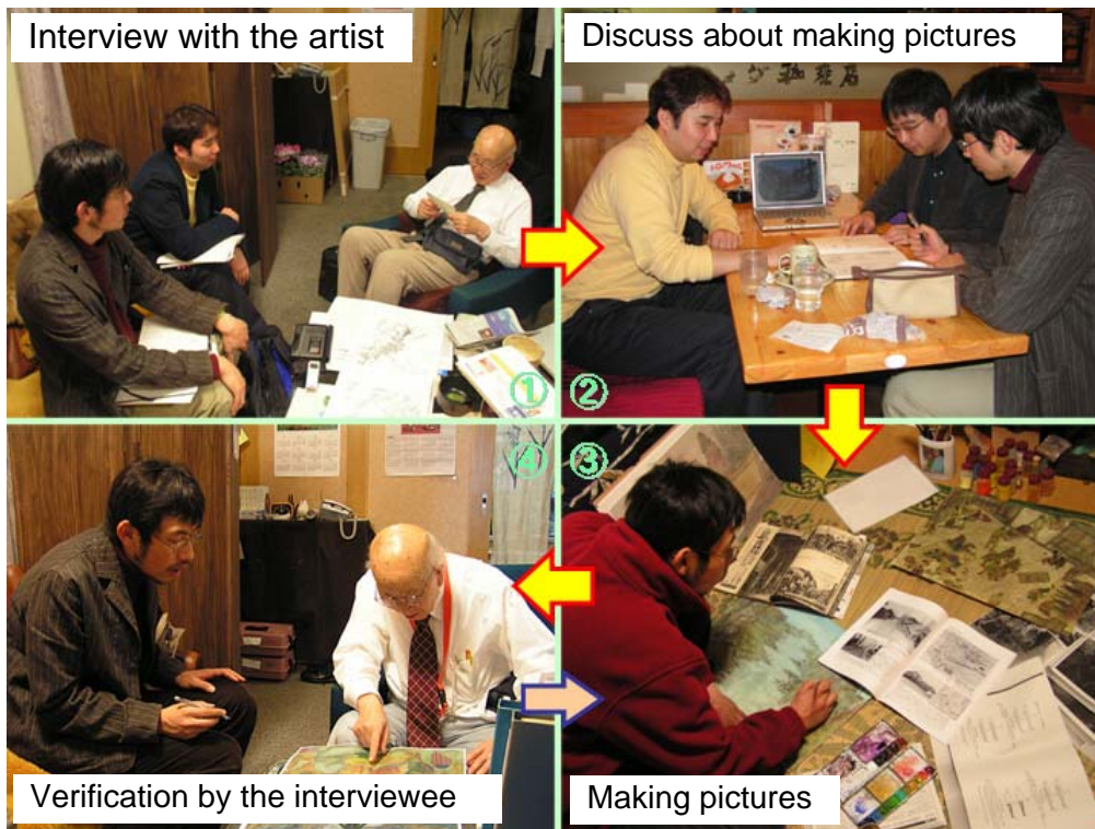
Figure2 The schematic process of making pictures which describe a personal disaster experiences. 1: Interview with the artist. 2: Discuss about making pictures. 3: Making Pictures. 4: Verification by the interviewee.

The earthquake occurred at the wake of Japan’s defeat in the World War II, at a time when the wartime media blackout enforced a strict regulation against reporting damages. For this reason, many Japanese citizens remained ignorant of the earthquake and the damages it caused (Hayashi and Kimura, 2006). Meanwhile, air raids continued at the damaged site of the earthquake, and combined with the social chaos that ensued, much of the records and documents of the earthquake, including photographs had been lost.