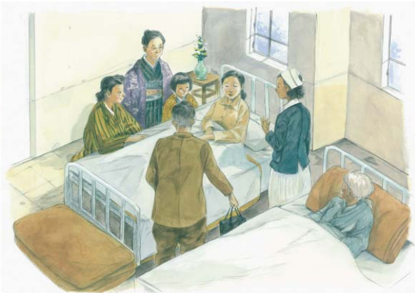
(4) I had suffered a fractured femur that took six months to heal.