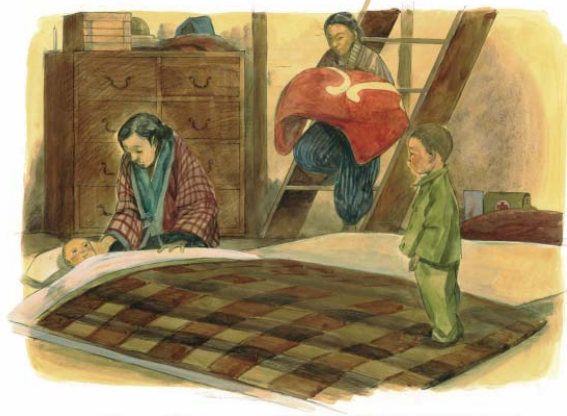
(1) My mother-in-law, my two children, and I began sleeping on the first floor.