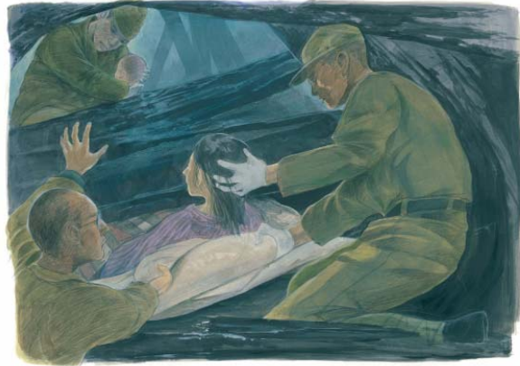
(2) My house collapsed immediately when the earthquake started. All family were shut in the fallen house.